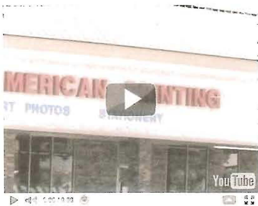
Click on Video Above for Orientation on Where Past Time Jr. (location of last two planning meetings) is.

Where? Past Time Jr. in Drusilla Shopping Center (SEE VIDEO BELOW for Details):