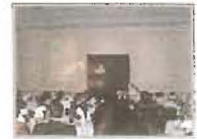
Photos of Auction Bidders Listening Intently Before Auction Begins (Click on Thumbnails to Enlarge)

Other Recent Auctions Dates for The Arthritis Foundation of LA: October 19, 2007; June 19, 2007